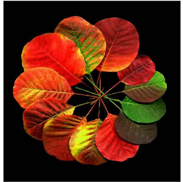
Smoke Leaves, Photograph