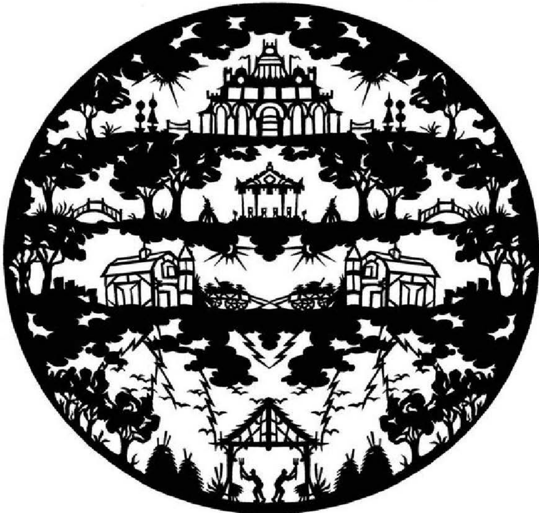
Le Monde, Papercut

...almost impose on you. You can feel "Magnolia," a single white bloom on a black background enveloping you in its simplicity. Whereas most of the pieces depict a single item or scene like "Paradise" and "The Nativity," "Le Monde" shows the full spectrum of life on and off of earth. Trees seemingly blend with clouds to unify heaven, hell, and all that lies between. There is comfort in the familiar and the way that the sections are unified helps to give us a way of interpreting them.