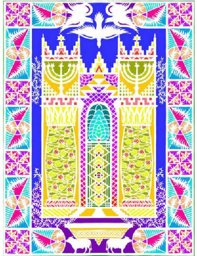
Green and White Temple, Papercut

All donations will be very much appreciated!