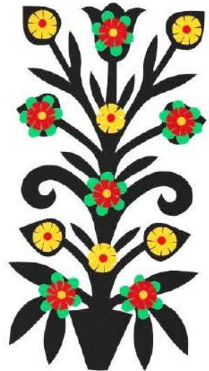
A last round of pots and tops on zeilki papercuttings.