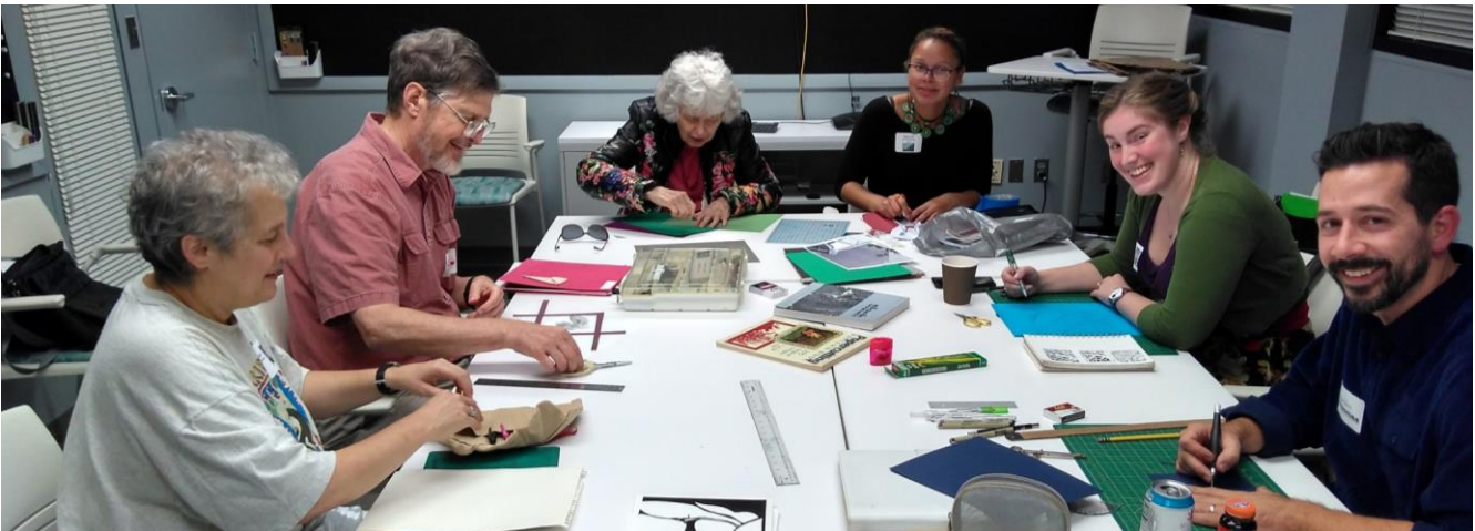
After the after party Guild members gathered for a cutting circle.